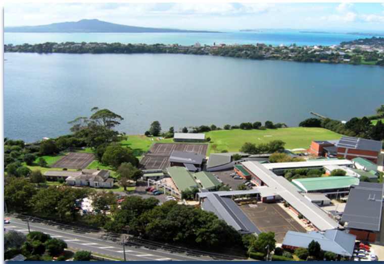
Aerial View of Carmel College beside Lake Pupuke. Rangitoto Island in the background