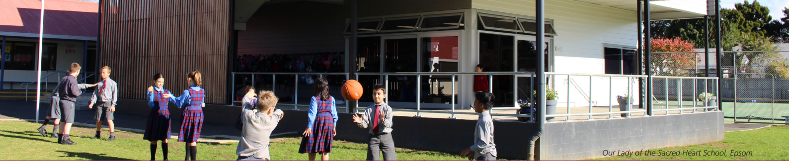
Our Lady of the Sacred Heart School, Epsom

Attendance Dues are used to pay for building related costs at Catholic Schools in the Auckland Diocese.