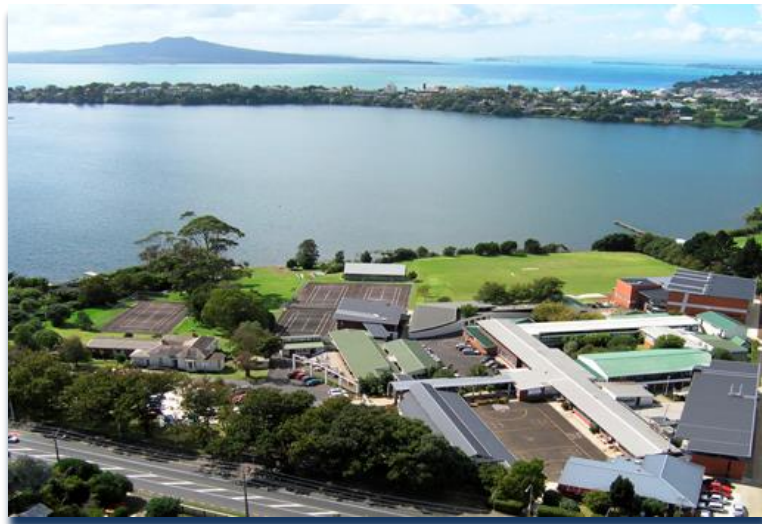
Aerial View of Carmel College beside Lake Pupuke. Rangitoto Island in the background